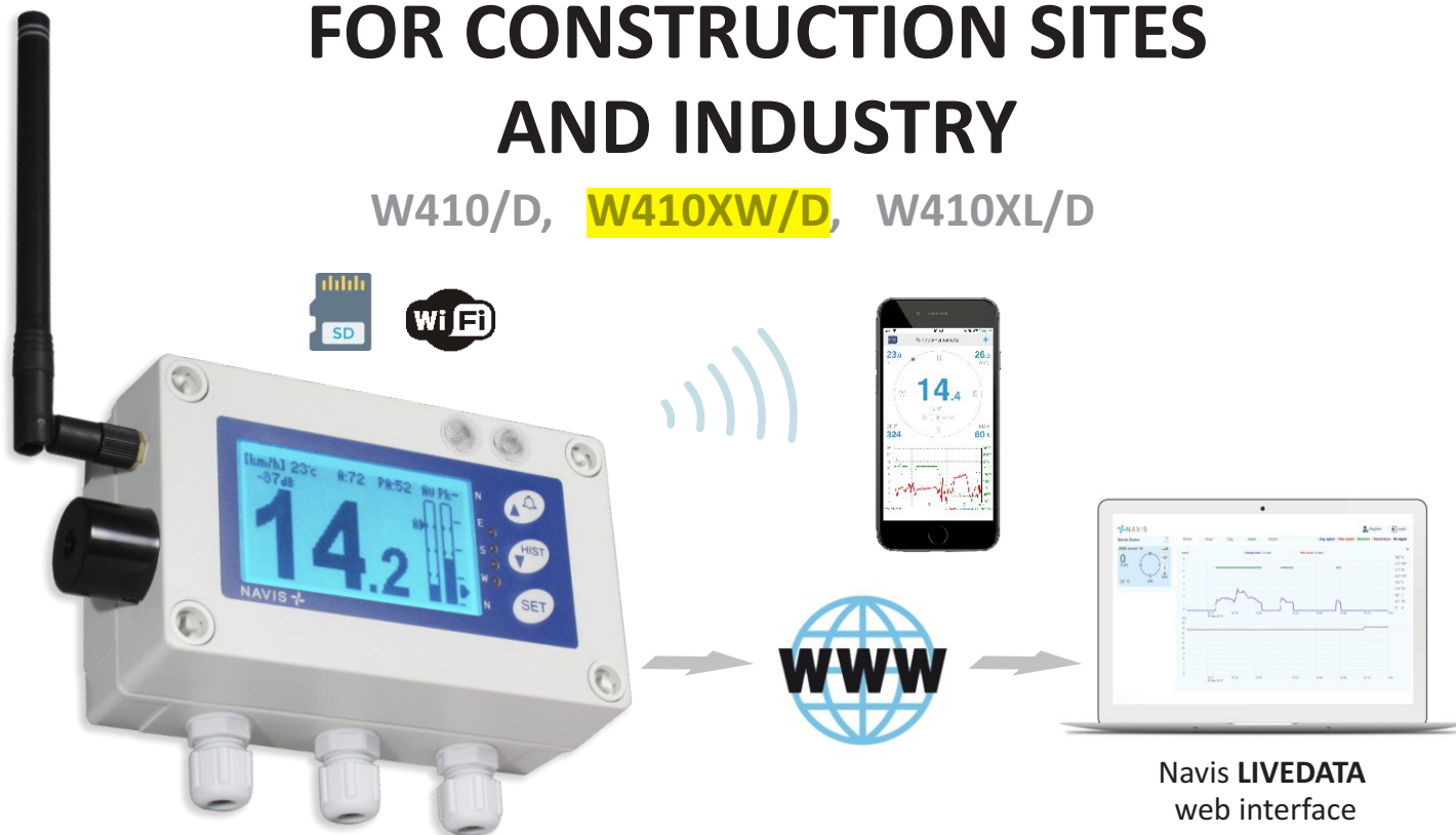
Navis LIVEDATA web interface